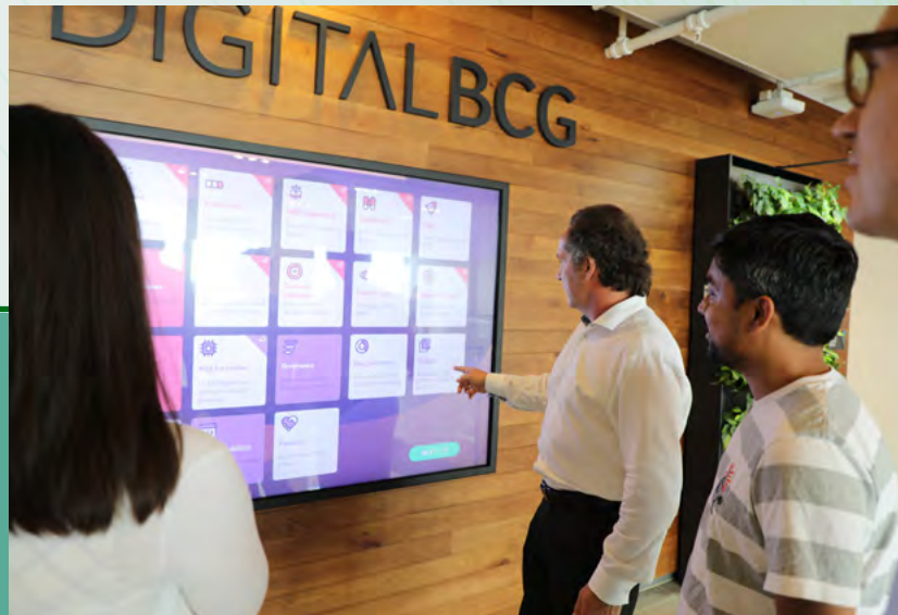
Quickly grasp digital concepts using interactive, hands-on content and technology