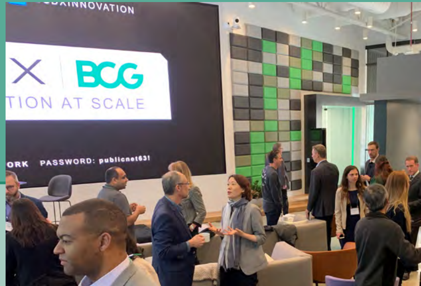
Network with other business leaders across industries