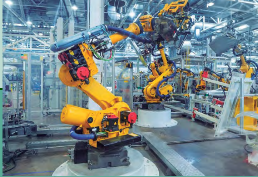
Explore the local technology and start-up ecosystem and discover new avenues for digital disruption