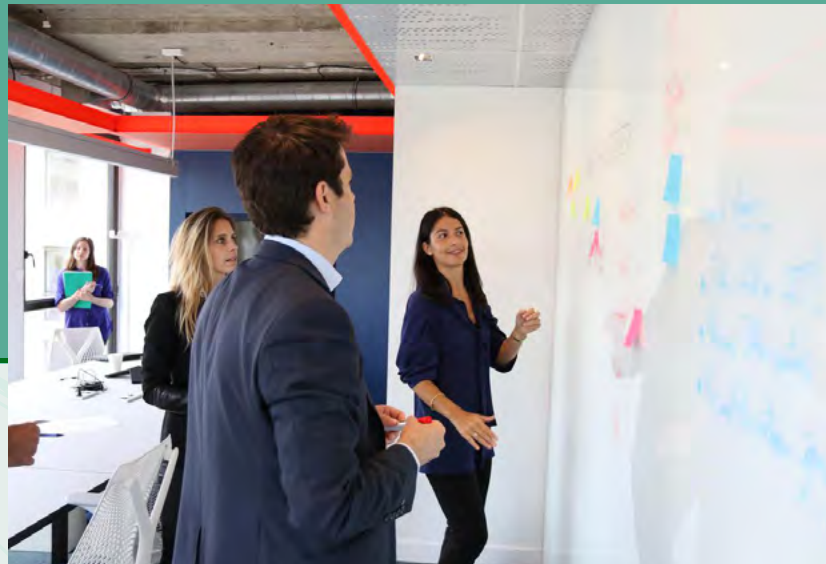
Experience new ways of working and the latest in workspace design