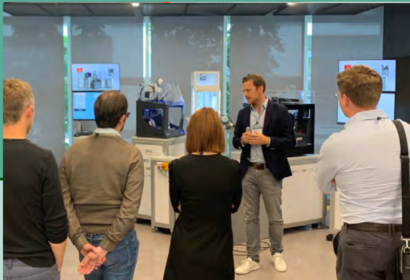
Discover cutting-edge technology and use cases