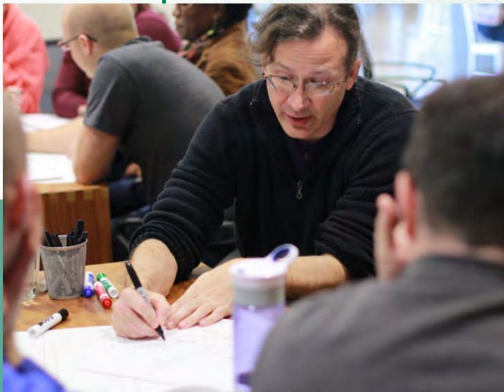
Meet with leading experts on digitization topics in the span of one day, with an action-oriented, tailored agenda