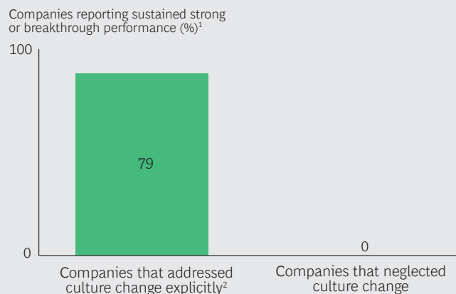
EXHIBIT 1 | It Pays to Focus on Culture During a Digital Transformation

Since the 2008 global financial crisis, graduates from the world's top ten MBA schools are 40% less likely to accept a job in investment banking than they were before the crisis. 1 Growing opportunities at companies such as Amazon and Google have intensified the competition for talent. Now, with their own digital transformations underway, banks are embracing a wide variety of approaches—such as perus-