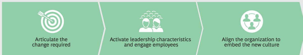
EXHIBIT 2 | How Do Companies Embed a Digital Culture?